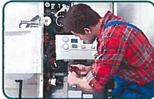
Have your heating system serviced annually