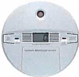
Carbon monoxide detector